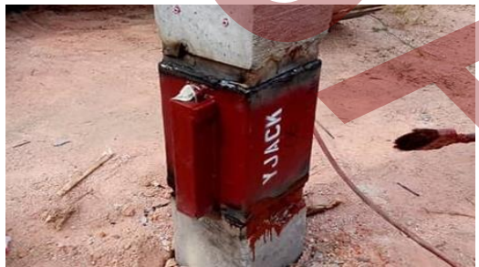
Joint-welded extension pile section(s) to YJACK (joint-welding follow contractor SOP)