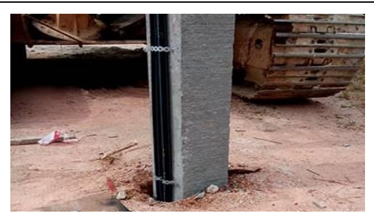
Continue driving the pile with YJACK until pile set (pile driving criteria follow contractor SOP)