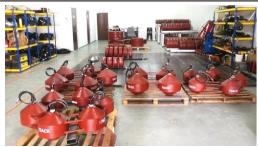
YJACK pre-fabricated in YJACK fabrication yard (rebar cage ready on site by contractor)