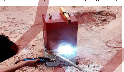
Joint-welded YJACK to starter pile section(s) (joint-welding follow contractor SOP)