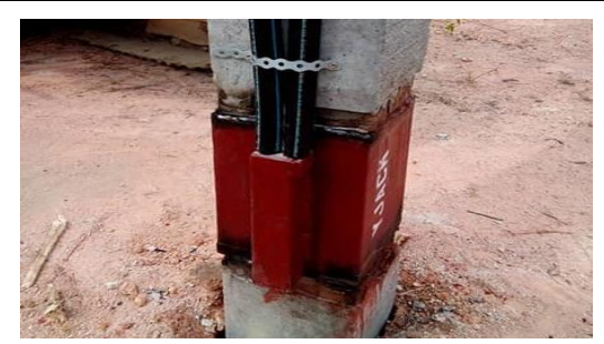
Connect hoses and telltales along the pile body (use poly pipes as protections, if necessary)